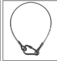
Safety wire, 50kg SWL P/N: 91604003