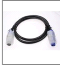
1.4m PowerCon power relay cable AWG 12 S P/N: 11850099