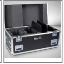
Flightcase for 6 x MAC Aura P/N: 91515020