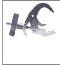
Quick-trigger clamp Ø38.1- 51mm P/N: 91602007