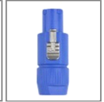
PowerCon NAC3FCA Power Input Connector P/N: 05342804