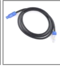
2.25m PowerCon power relay cable AWG 12 P/N: 11850100