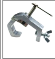
G-Clamp P/N: 91602003