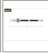
3m pwr.cable w.PwrCon NAC3FCA, AWG12 SJT P/N: 11541503