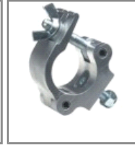
Half-coupler clamp for Ø50 P/N: 91602005